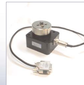
Vortex Static Torque Transducer (choose from 10, 6, or 1.5N.m maximum capacity)