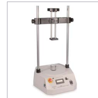
Vortex Motorised Torque Stand

Each module of the Vortex is sold separately so that you only need purchase the parts you require. Build your system from the following elements,