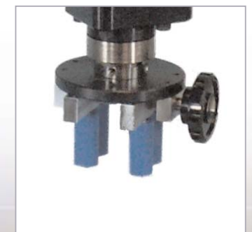
Upper Mounting Table, 8 - 55mm opening (not recommended for use with 1.5N.m sensor)

Dynamic Measurement Systems, LLC Sales, Service, Rentals Web: www.dynmeasure.com email: dyna@dynmeasure.com